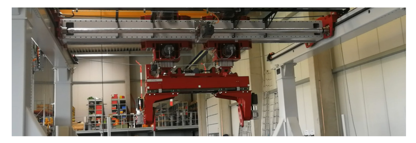
Güdel gantry with the gripping unit assembled on the H-loader