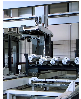
Güdel Gantry places a finished axle on a transport pallet