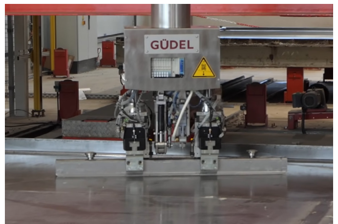
Güdel double gripper unit sets and releases a formwork element