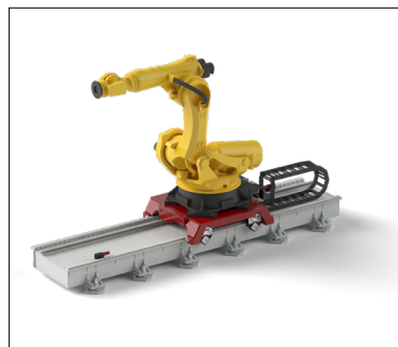
Linear track TMF-5 with FANUC