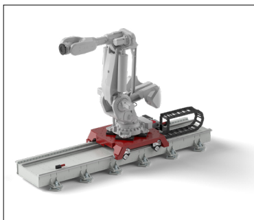
Linear track TMF-5 with ABB

on the TMF-5. The industrial robots located on the TMF-5 can move a payload of up to 1300 kg. This enables fully flexible use in the heavy-duty sector. With its seventh axis, the TMF-5 opens up new work applications in the production process.