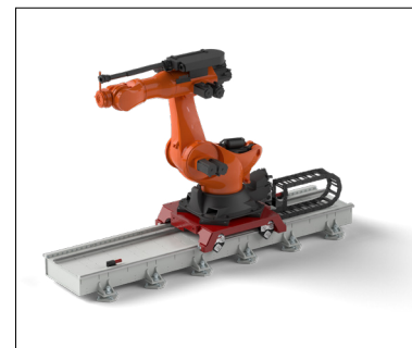
Linear track TMF-5 with KUKA