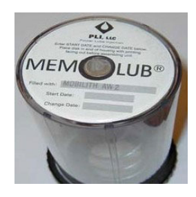
3. Remove the label from the replacement cartridge. Enter the start date and the exchange date.