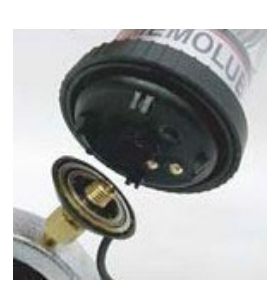
8. Screw the MEMOLUB® onto the MEMO.