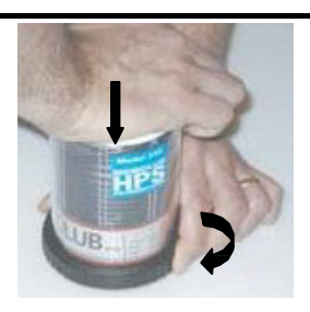
7. Press the hood downward and turn the black ring clockwise.