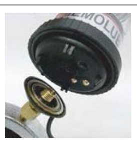
3. Screw the MEMOLUB® onto the MEMO.