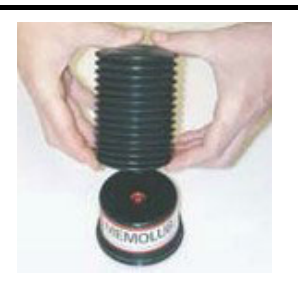
5. Set the cartridge on the casing.