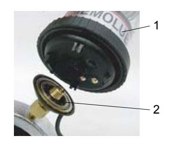
1. Unscrew MEMOLUB® (1) from MEMO (2). MEMO remains screwed to the point of application.