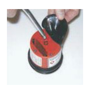
Note: If necessary, prepare the MEMOLUB® with a manual grease gun (only for grease cartridges).