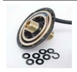
1. Program the lubrication amount by inserting the dosage washers.