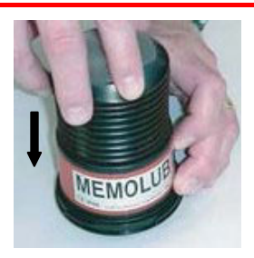
5. Turn the casing over together with the cartridge.