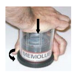
2. To open, place the lubricator on a flat surface. Press the hood downward and turn the black ring counterclockwise.