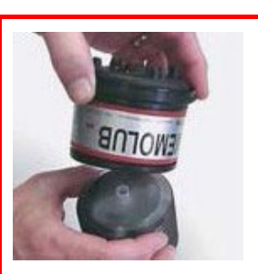
4. Carefully remove the cover of the cartridge. Place the casing upsidedown on the cartridge.