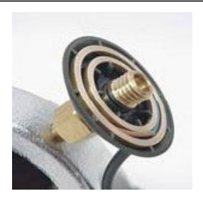
2. Mount the MEMO directly on the lubrication point or the progressive distributor.