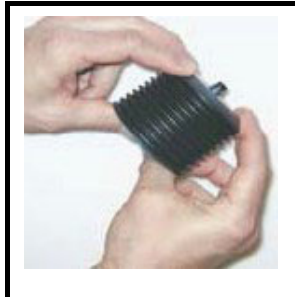
4. Press the air carefully out of the cartridge.