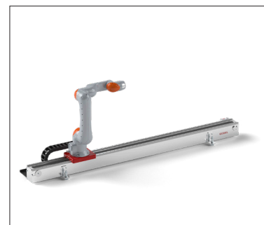
CoboMover CMF traversing axis with Kuka Cobot