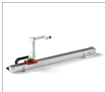
CoboMover CMF traversing axis with Fanuc Cobot CRX-10iA