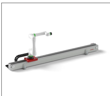
CoboMover CMF traversing axis with Fanuc Cobot CRX-10iA

The CoboMover is also a good partner for assembly work and surface treatment. Güdel has redesigned the seventh axis for cobots from scratch and, with over 70 years of experience in the field of linear technology a safe and reliable product on the market. However, should something not run perfectly, our worldwide service team will be happy to help.