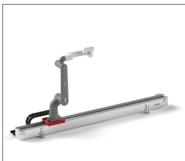
CoboMover CMF traversing axis with ABB Cobot

The CoboMover is also a good partner for assembly work and surface treatment. Güdel has redesigned the seventh axis for cobots from scratch and, with over 70 years of experience in the field of linear technology a safe and reliable product on the market. However, should something not run perfectly, our worldwide service team will be happy to help.