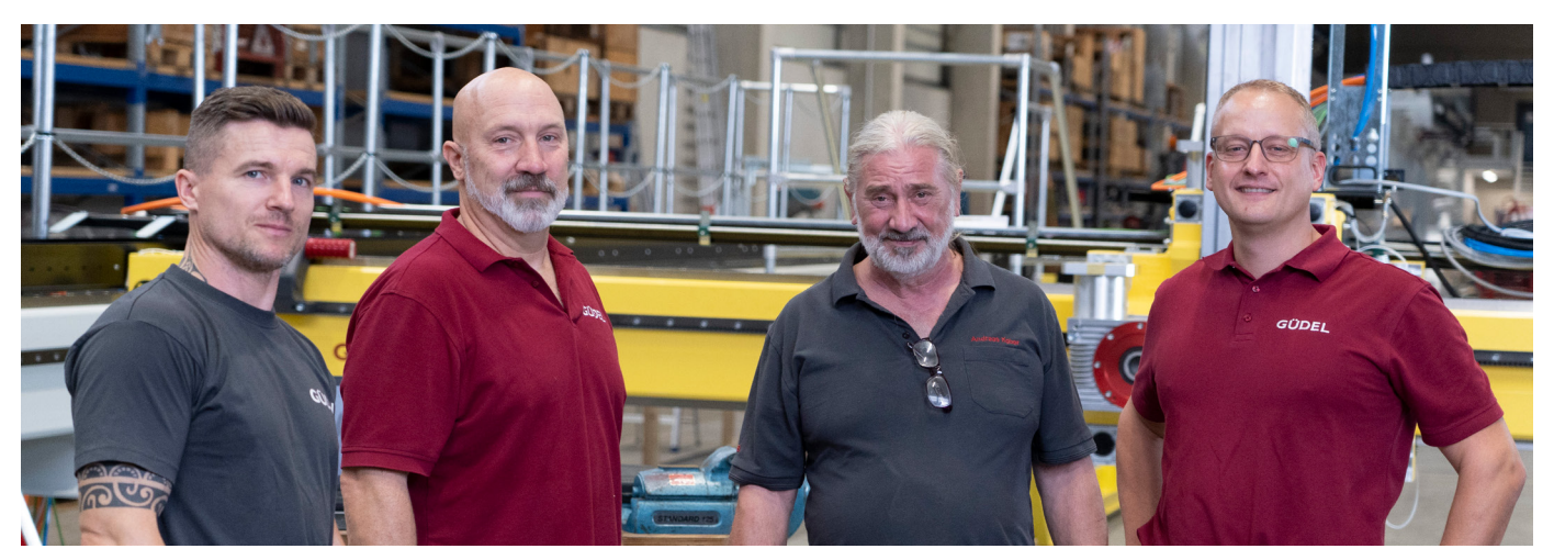
Güdel Prime Care Team