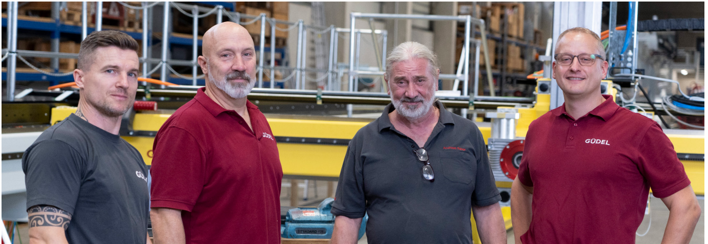
Güdel Prime Care Team