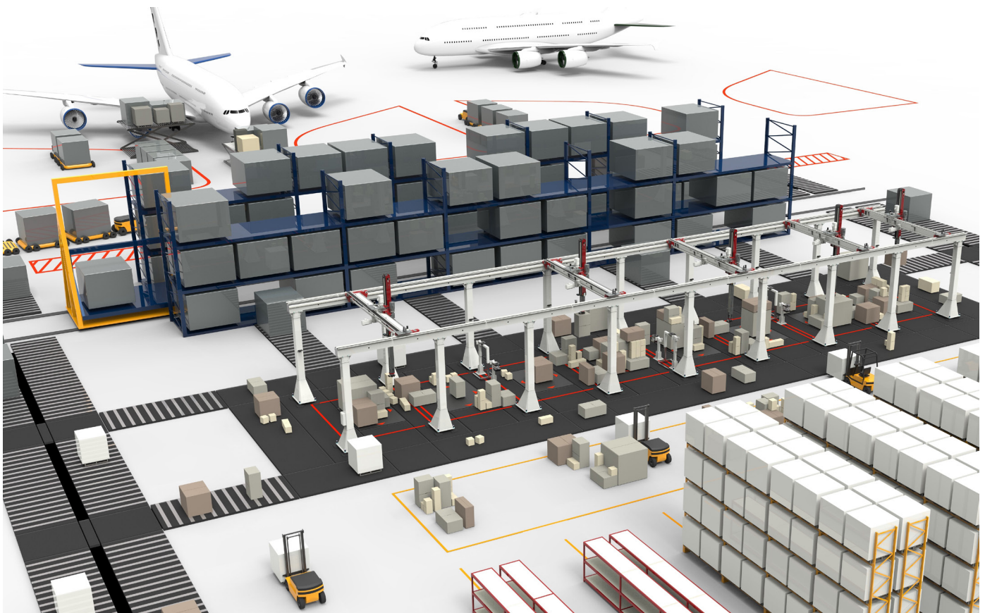
The new robotic system is expected to change the way air freight ground handlers store and move cargo at airports around the world.